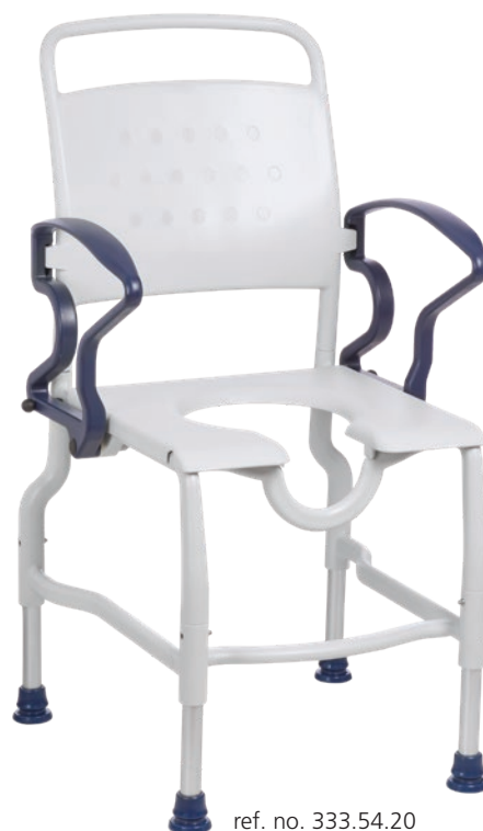
ref. no. 333.54.20