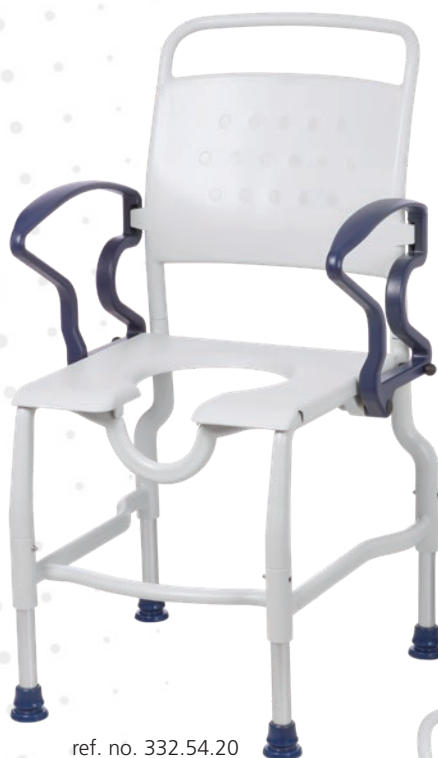
ref. no. 332.54.20