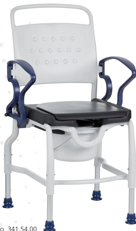
ref. no. 341.54.00