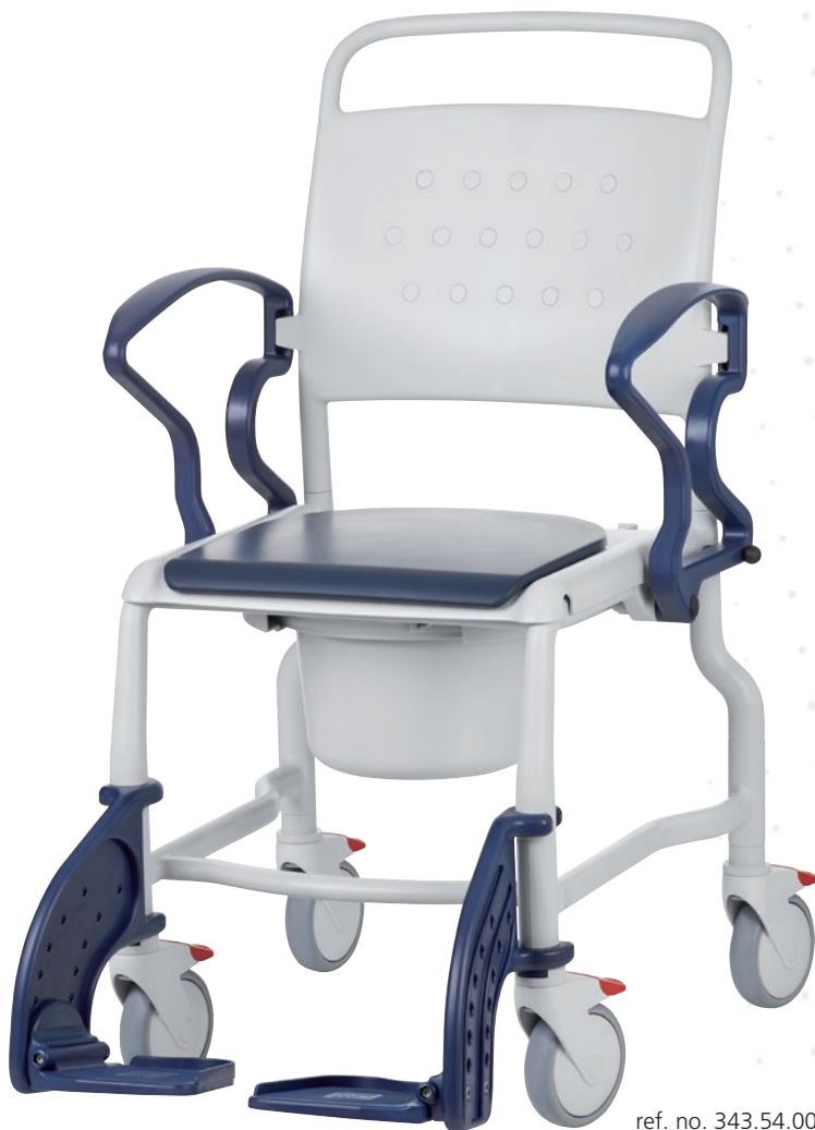
ref. no. 343.54.00