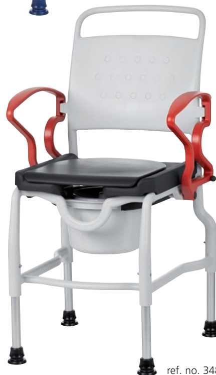
ref. no. 348.30.00