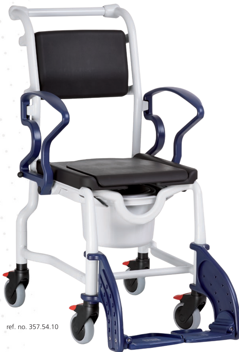
ref. no. 357.54.10