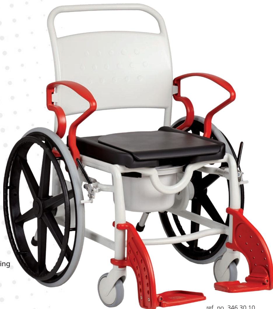
ref. no. 346.30.10