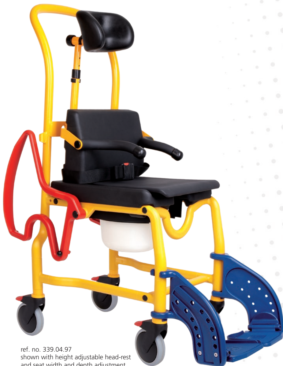
ref. no. 339.04.97 shown with height adjustable head-rest and seat width and depth adjustment