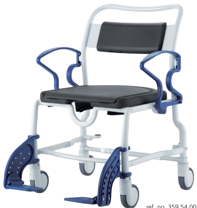
ref. no. 359.54.00