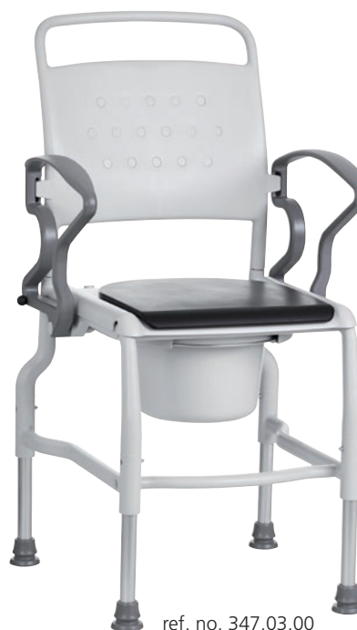
ref. no. 347.03.00