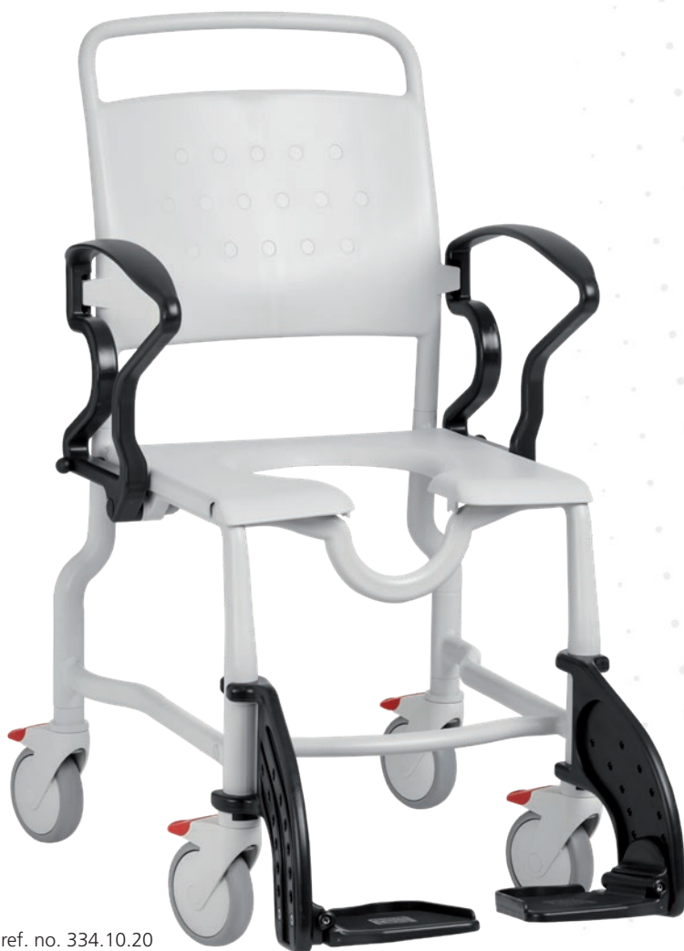
ref. no. 334.10.20