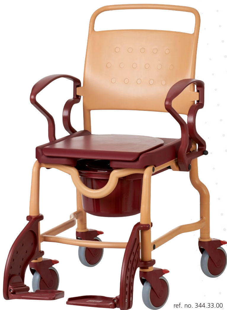
ref. no. 344.33.00