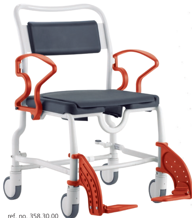
ref. no. 358.30.00