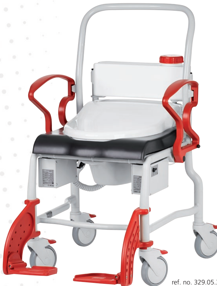
ref. no. 329.05.30