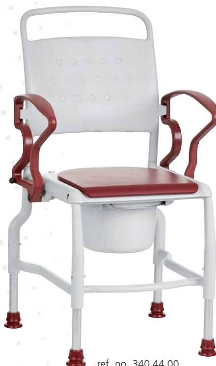
ref. no. 340.44.00